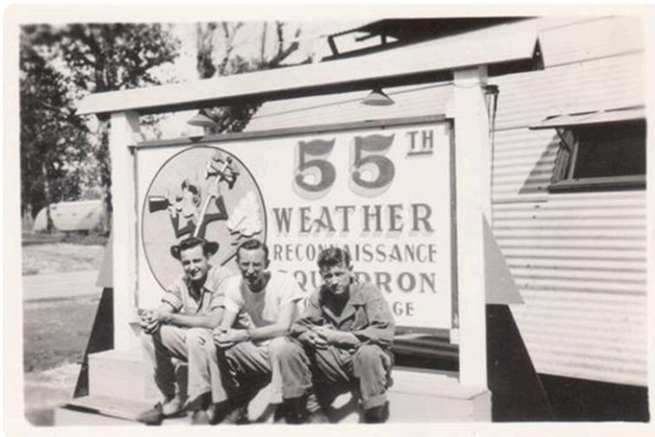
WWII Guam time