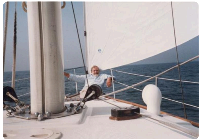
Sailing with friends on Long Island Sound