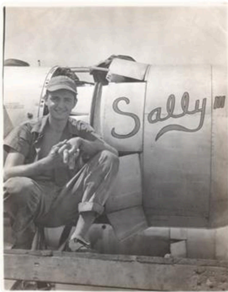
WWII Ed plane artwork