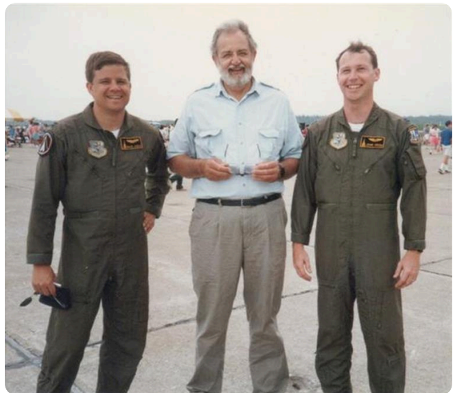
Fini-flight fun at Plattsburgh AFB, 1991