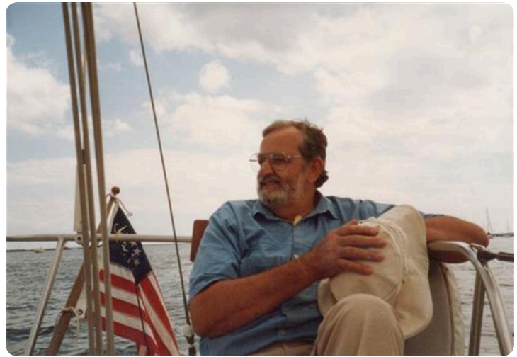
Buzzards Bay 1980's