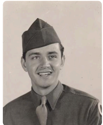
Biloxi MS training