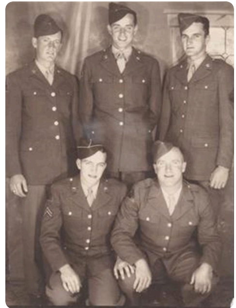
1945 Biloxi MS