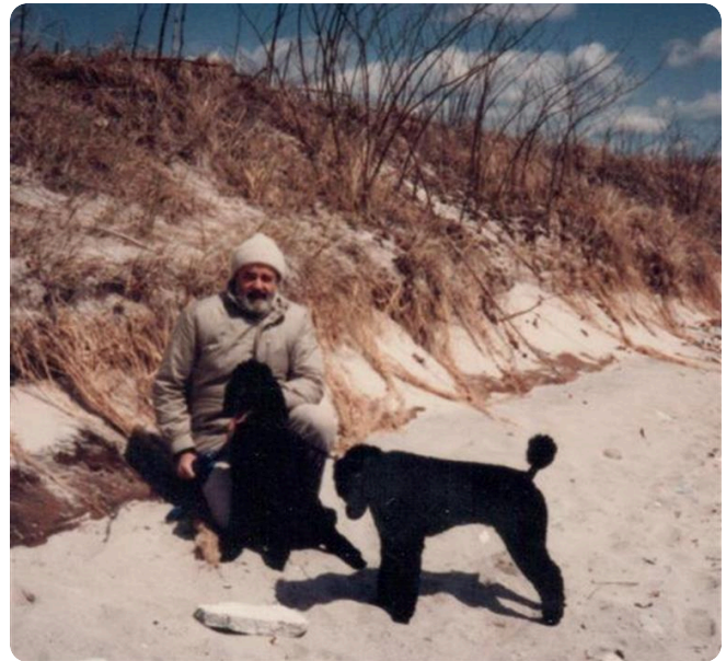
1980's Winter beach time with the poodles