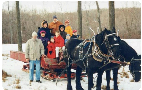
Holiday sleigh ride in CT 1997